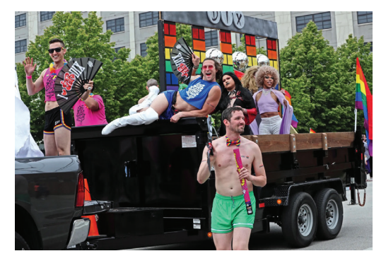
Open to the Public All motorcycles and all riders are invited to the world's largest LGBTQ motorcycle run.

Friday, June 3, 2022 @ 3 p.m. House of Harley-Davidson 6221 W. Layton Ave., Milw., WI 53220 Hosted by: Pride Rides Wisconsin, House of Harley-Davidson and Ride With Pride MKE